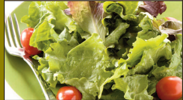
SIDE SALAD • $3.55

Dressing: Blue cheese • Ranch • Fat-free Ranch Lite Italian • Honey mustard